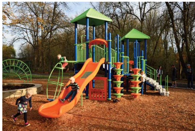
The colorful new apparatus at McMillan Park inspires not only fun but imaginative play for all ages and abilities. It replaced a set that had been there since 1994.